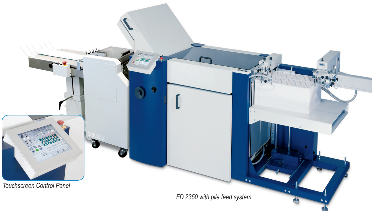
Touchscreen Control Panel