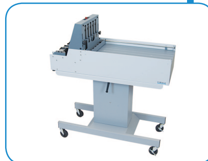
Optional V-Stack36 Vertical Stacker with adjustable-height stand

MyBinding.com 5500 NE Moore Court Hillsboro, OR 97124 Toll Free: 1-800-944-4573 Local: 503-640-5920