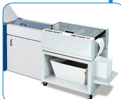
FD 2380 with in-line FD 676 Burst