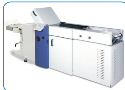
FD 2300 air-feed

** Three phase power is required. NOTE: The FD 2300-EX model requires both a 3-phase 220V outlet and a second separate 220V outlet (single phase) for the extended airfeed deck.